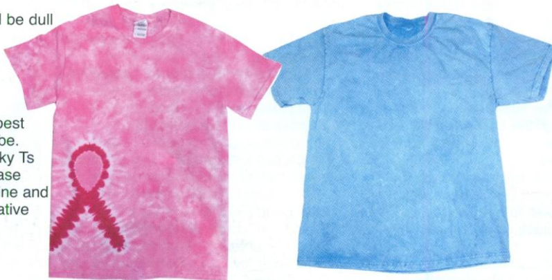
RAINBOW: variations from the Colortone TD002 T shirt range.

■ For more information please visit www.tiedye.eu